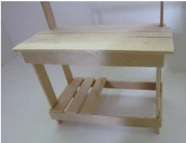
6 – Lay bottom shelf leaving small even spaces between each stick. Glue picket pieces as per instructions.