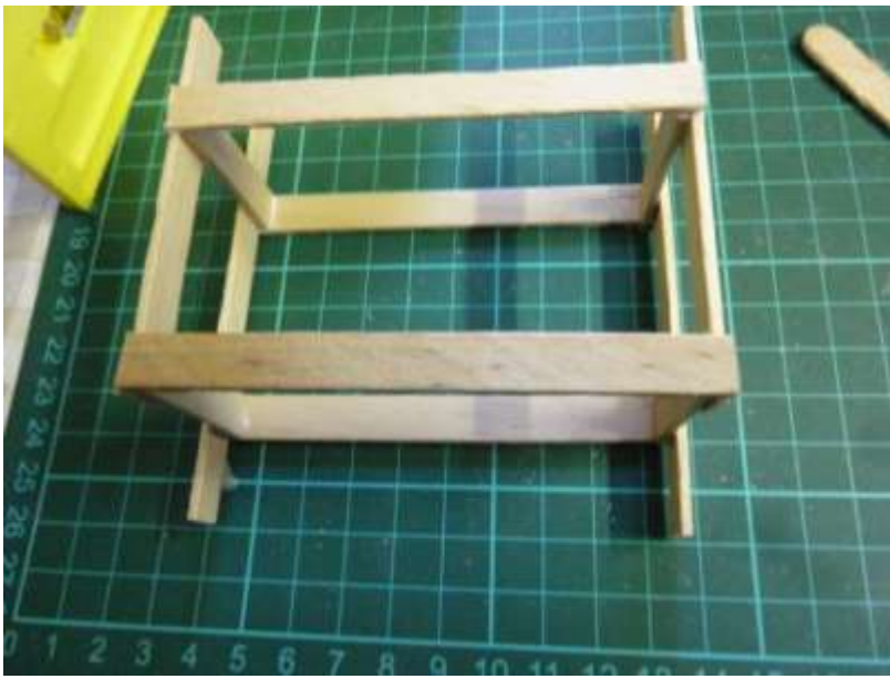
4 – Attach front and back supports