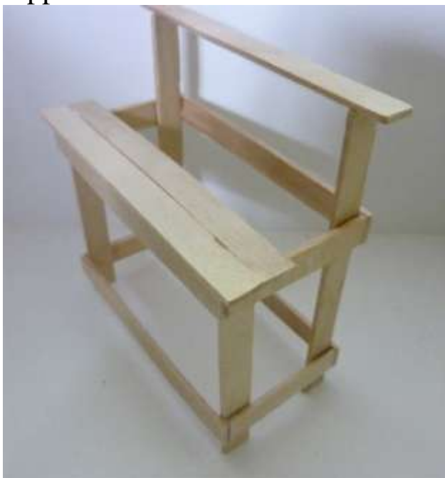
5 – Lay top shelf on tall back supports. Start laying top of bench from front - overlapping front by approx 2mm.